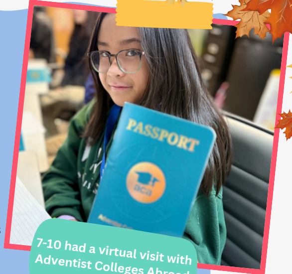
7-10 had a virtual visit with Adventist Colleges Abroad